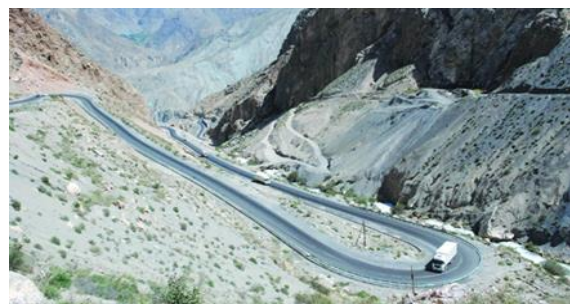
Dushanbe-Chanak Highway, Tajikistan built by the China Road and Bridge Corporation (CRBC).