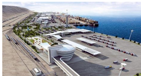
Turkmenbashi International Port on the Caspian Sea.